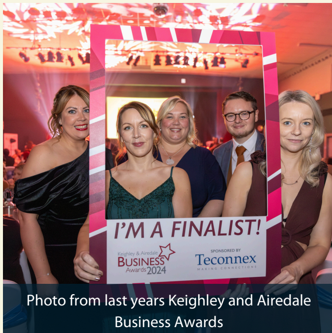
Photo from last years Keighley and Airedale Business Awards