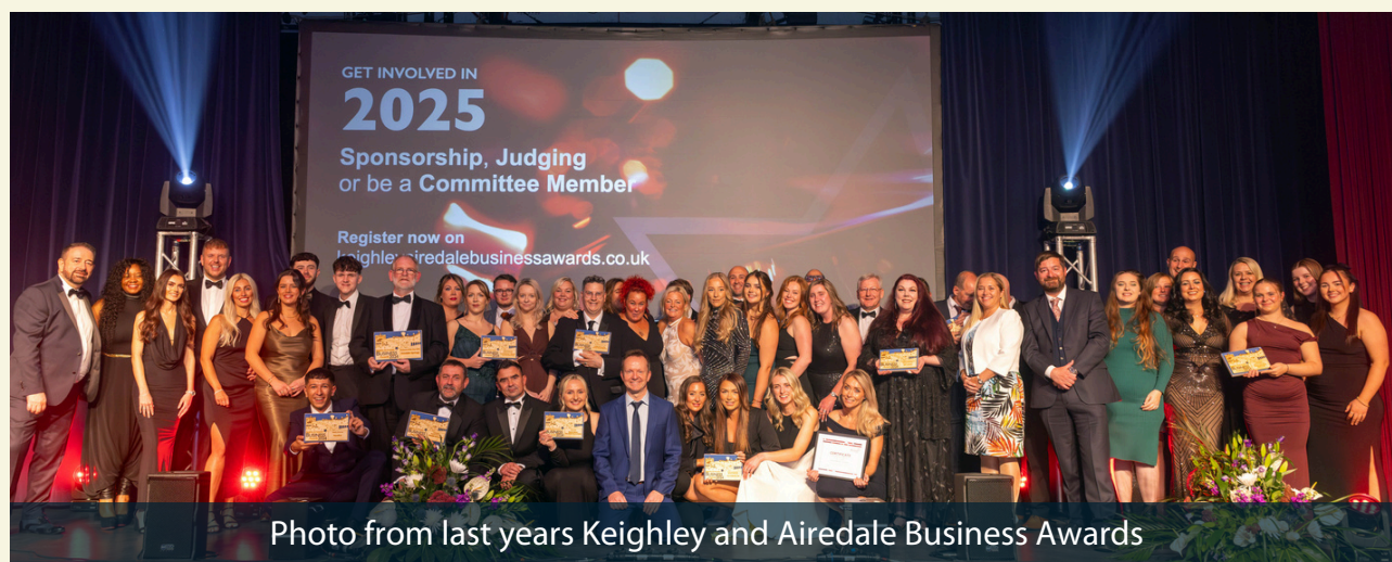
Photo from last years Keighley and Airedale Business Awards

A spokesperson for Spellman Care said, "We are incredibly proud to see our hard work and dedication recognised across so many respected platforms. These nominations are a direct result of our team's commitment to providing exceptional care and fostering a supportive and positive environment for everyone we serve. We wish all the finalists the very best of luck."