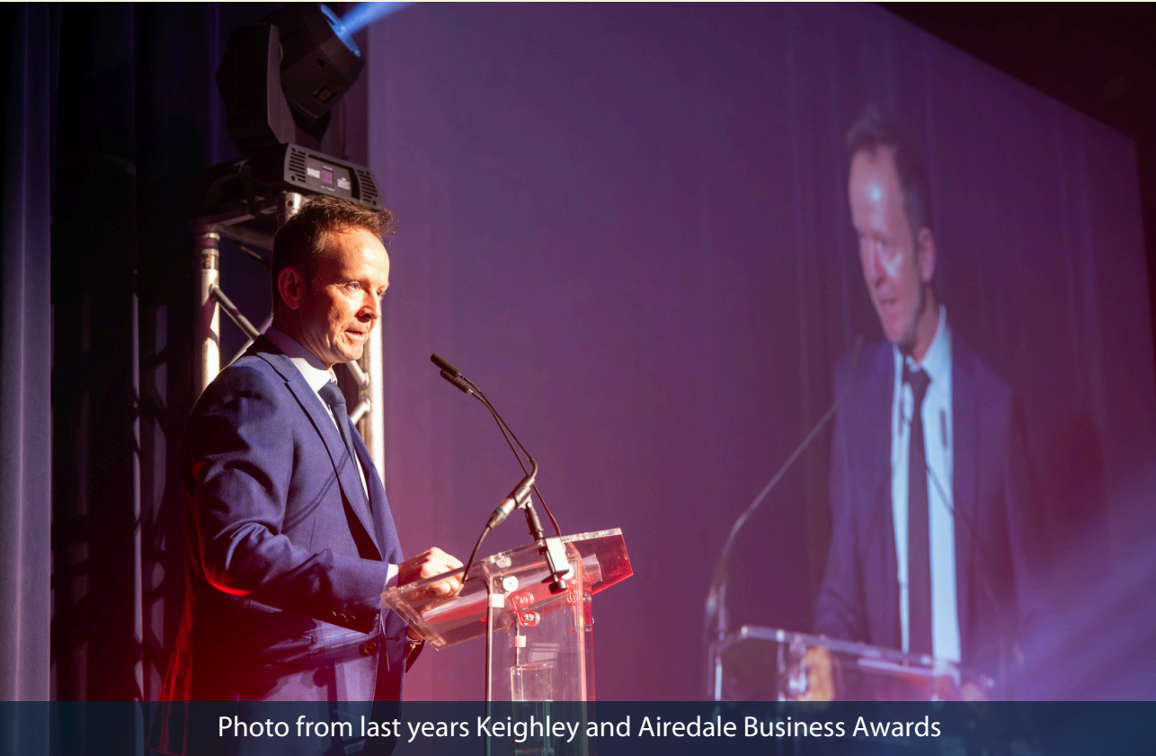
Photo from last years Keighley and Airedale Business Awards