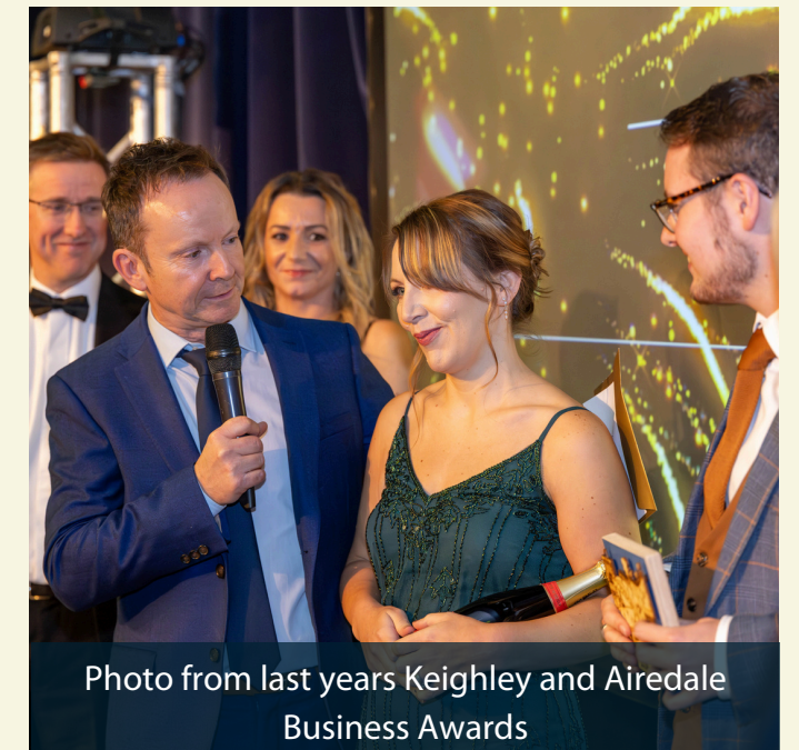
Photo from last years Keighley and Airedale Business Awards

The Keighley and Airedale Business Awards celebrate the very best in the local business community, recognising the hard work and dedication of businesses in the region. Following its win for Independent/Family Business of the Year last year, Spellman Care is once again a finalist, this time for the Health & Wellbeing Business of the Year award. The nomination celebrates the company's widespread success, underscored by over 197 five-star reviews on CareHome.co.uk , its strong community connections through initiatives like the Veterans Cafes, and its commitment to professional growth. The black-tie ceremony will be held this Friday, 26th September 2025, at... (continued on page 4)