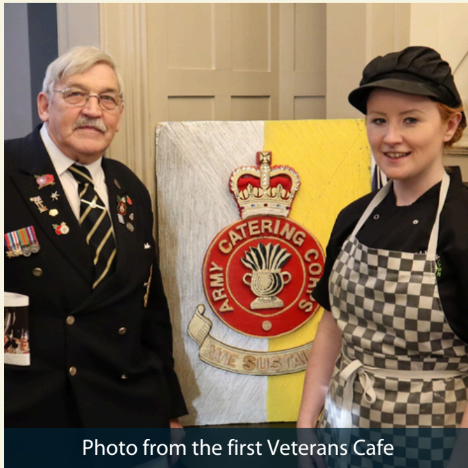
Photo from the first Veterans Cafe