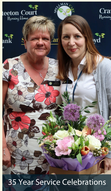
35 Year Service Celebrations